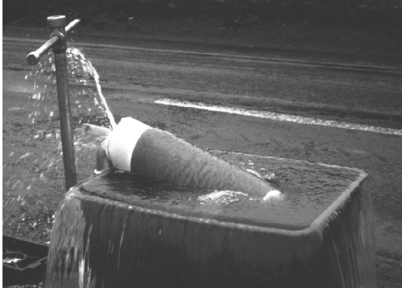
Plate 6.1. Sampling animals and loose deposits in a fine-meshed sampling net.